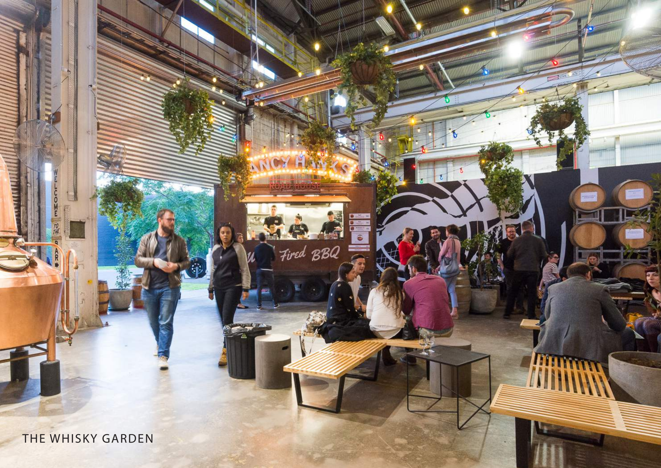
THE WHISKY GARDEN